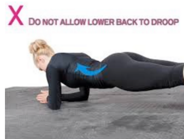
The two individuals above are cheating . Your butt and hips should be in line with the rest of your body.